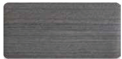
Teak Silver Grey