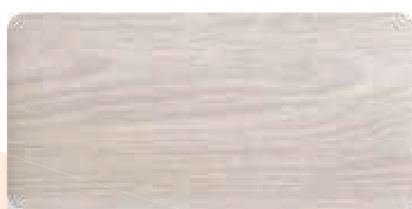
Sheffield Oak Light