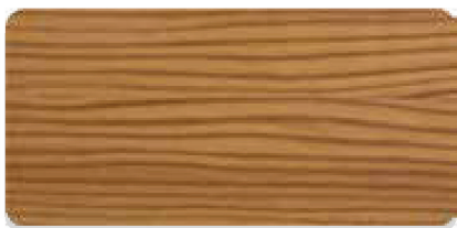
Oregon Pine Natur

Wooden textures have always been an evergreen choice when it comes to beautifying our properties. In a bid to preserve nature, wooden textured laminates are a perfect replacement.