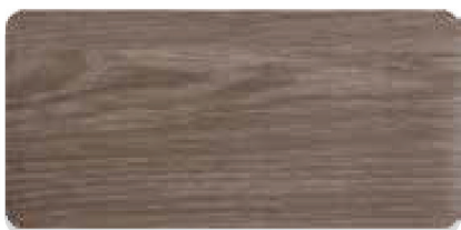
Sheffield Oak Grey